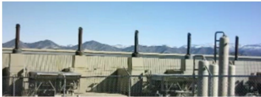
This is what it really looks like...

Spectra Energy plans to run their 36" or 42" Nexus high pressure natural gas pipeline through Medina County along a route going from southeastern Ohio to Ontario, Canada for export. This requires clear-cutting 100 feet of land up and down the route, whether forests, farms, towns, wetlands, or homes that are already there. Compressor stations up to 80 acres in size will also be placed every 30-70 miles along the route. This pipeline is happening because of the growing "fracking" industry in Ohio.